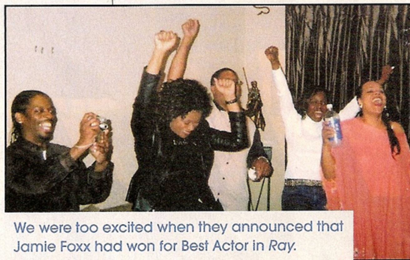
We were too excited when they announced that Jamie Foxx had won for Best Actor in Ray .