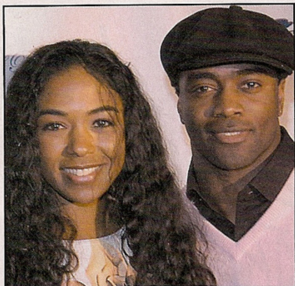
Ananda Lewis and Curtis Martin were also on hand to celebrate with Regina King.